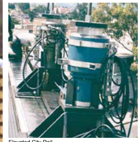
Elevated City Rail, Mexico City