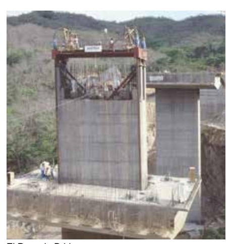
El Pozuelo Bridge México-Acapulco Highway