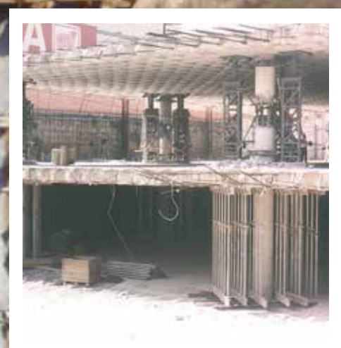
Colegio Civil" square, Monterrey, México